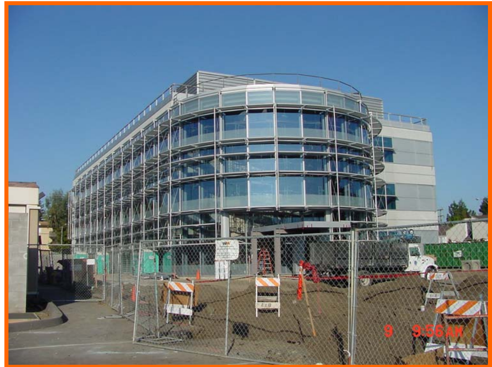
VHC - Fair Oaks